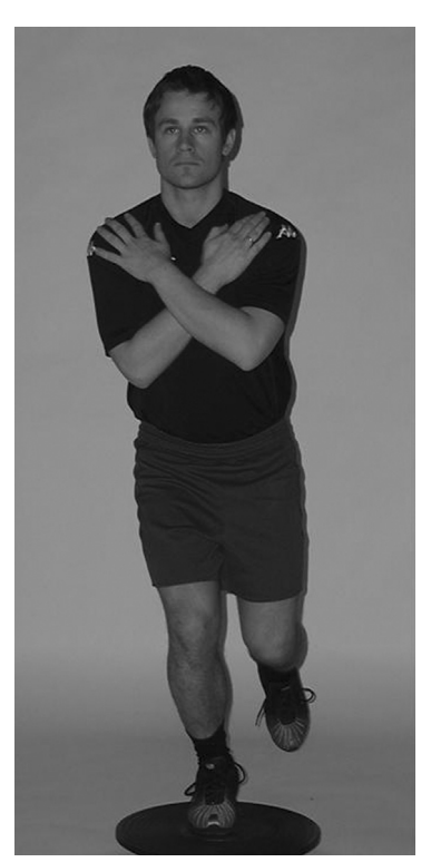
Figure 3. Example of a knee exercise. The exercise was prescribed to be performed in the knee-over-toe position and a flexed knee, with gradual progression in difficulty (see Table 2).

Based on the questionnaire, the 508 players were divided into 2 groups (Figure 1), a high-risk (HR) and a low-risk (LR) group. The criteria for classifying a player as having an assumed increased risk of injury were a history of an acute injury to the ankle, knee, hamstring or groin during the previous 12 months or a reduced function with