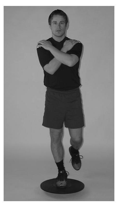
Figure 2. Example of an ankle exercise. The exercise was prescribed to be performed with a straight leg and with a gradual progression in difficulty (see Table 1).

injuries, resulting in a final sample of 508 players representing 31 teams.