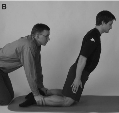
Figure 5. The hamstring exercise program. (A) start position. The player stands on his knees on a soft foundation with the feet being held by a partner. (B) slowly lowering the body toward the ground using the hamstrings while focusing on keeping the body straight (see Table 4).